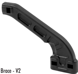
#353089 Composite Rear Brace - V2