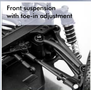
Front suspension with toe-in adjustment