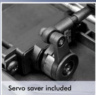
Servo saver included