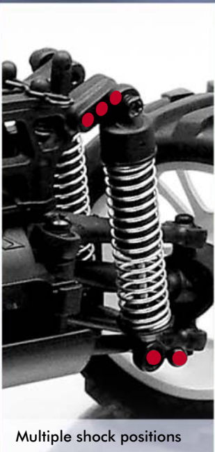
Multiple shock positions