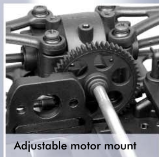
Adjustable motor mount