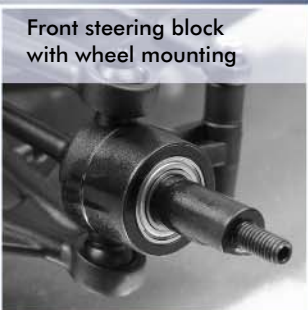
Front steering block with wheel mounting