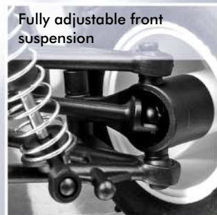
Fully adjustable front suspension