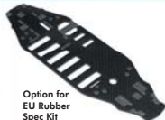
#301123 Chassis 3.5mm Extra-Thick