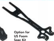
#301178 Narrow Upper Deck Rubber-Spec