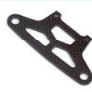
#301213 Graphite Bumper Upper Holder