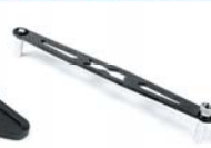
#306163 Graphite Battery Strap with Alu Stands