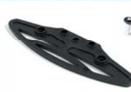
#301203 Impact Absorbing Bumper