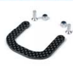
#303060 Graphite Motor Guard