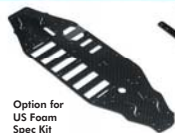
#301122 Chassis 2.5mm Multi-Flex