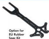
#301179 Wide Top Deck Foam-Spec