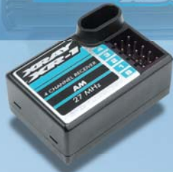
XRAY XR1 RECEIVER 3-CHANNEL