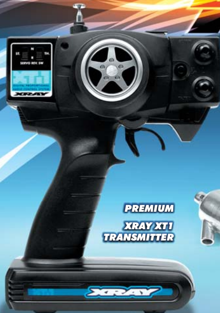
PREMIUM XRAY XT1 TRANSMITTER