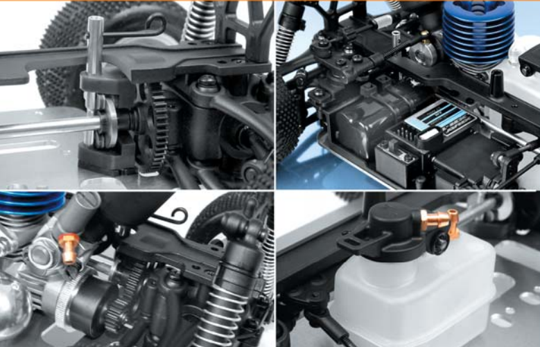
Steel spur gear

Easy access to rear linkage allows quick adjustments for fine tuning