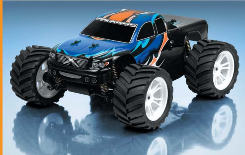
Painted & trimmed RTR monster truck body