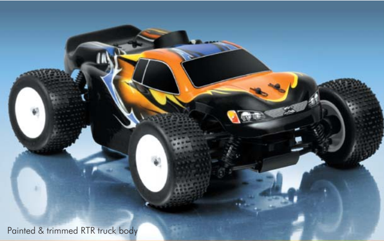
Painted & trimmed RTR truck body

Laser cut hand-ground steel brake disk provides adjustable precise four wheel braking