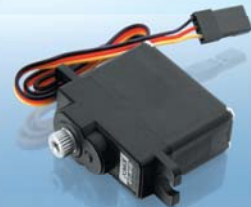
2x METAL GEAR SERVO