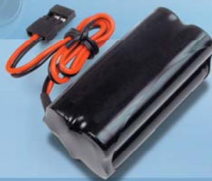
RECEIVER BATTERY PACK