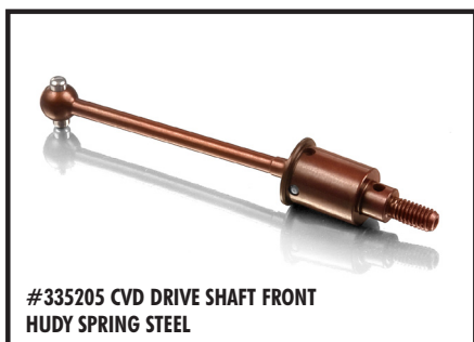
#335205 CVD DRIVE SHAFT FRONT HUDY SPRING STEEL