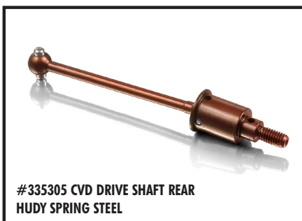
#335305 CVD DRIVE SHAFT REAR HUDY SPRING STEEL