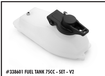
#338601 FUEL TANK 75CC - SET - V2