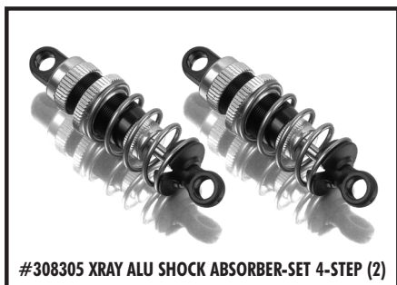
#308305 XRAY ALU SHOCK ABSORBER-SET 4-STEP (2)