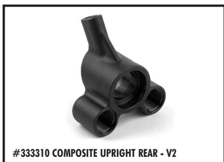
#333310 COMPOSITE UPRIGHT REAR - V2