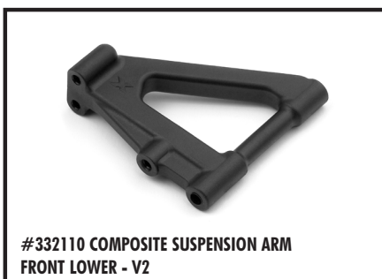
#332110 COMPOSITE SUSPENSION ARM FRONT LOWER - V2