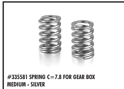
#335581 SPRING C=7.8 FOR GEAR BOX MEDIUM - SILVER