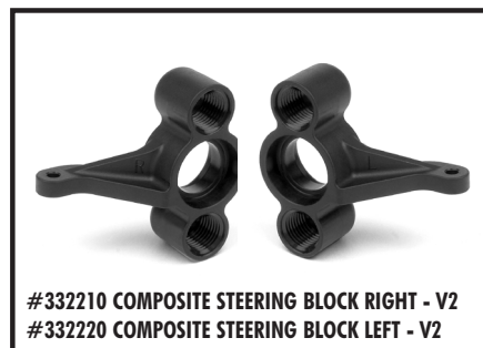
#332210 COMPOSITE STEERING BLOCK RIGHT - V2 #332220 COMPOSITE STEERING BLOCK LEFT - V2