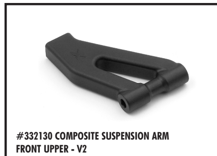
#332130 COMPOSITE SUSPENSION ARM FRONT UPPER - V2