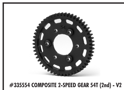
#335554 COMPOSITE 2-SPEED GEAR 54T (2nd) - V2