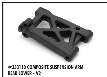
#333110 COMPOSITE SUSPENSION ARM REAR LOWER - V2