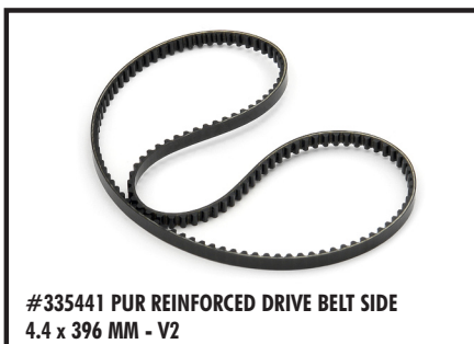
#335441 PUR REINFORCED DRIVE BELT SIDE 4.4 x 396 MM - V2