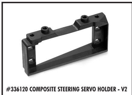
#336120 COMPOSITE STEERING SERVO HOLDER - V2