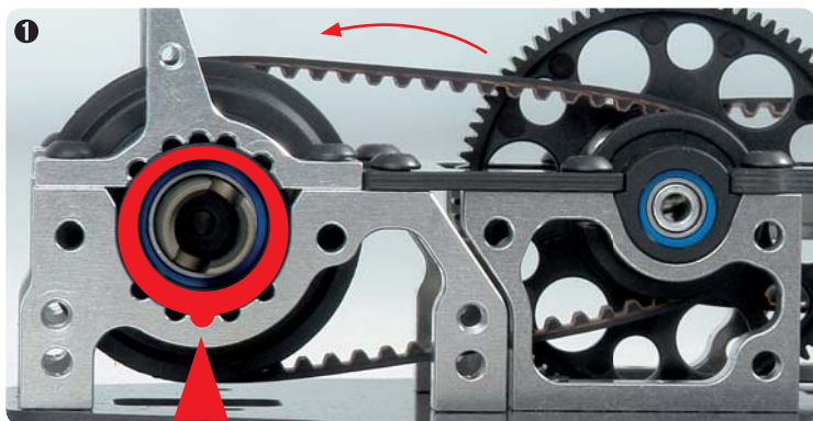
MIDDLE POSITION: The basic position for belt tension.

The integrated belt tension adjustment allows you easily adjust the tension of the belt depending on its wear rate. There are multiple adjustment positions that are good for regular racing conditions. When the belt becomes very worn, you can still use the end adjustment position where the upper bulkhead mounts to the lower bulkhead.